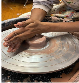
Art and Music