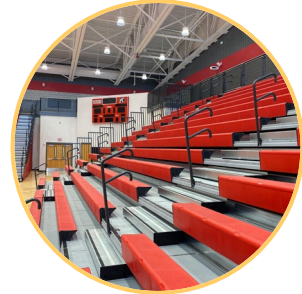
New bleachers for 19 HS gyms