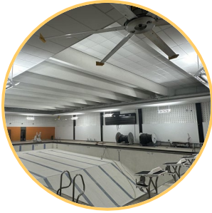
Completion of 5 pool renovations