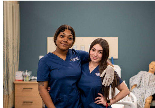
Career and Technical Education