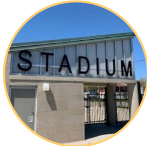
Enhancements to Vincent and Pulaski Stadiums