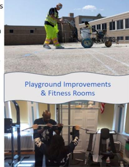
Playground Improvements & Fitness Rooms