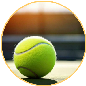
Completion of tennis court upgrades at 3 facilities