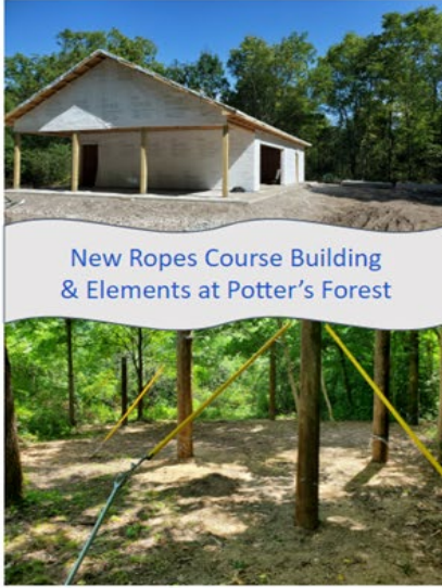
New Ropes Course Building & Elements at Potter's Forest