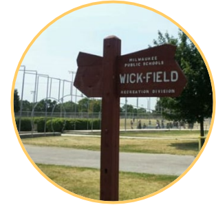
Installation of turf baseball & softball diamonds at Wick Playfield begins