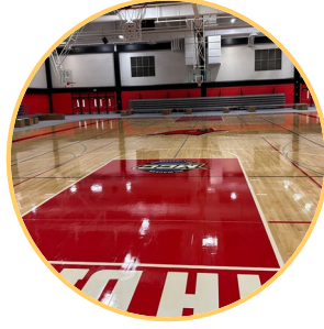
Renovation of North & Vincent fieldhouses begins