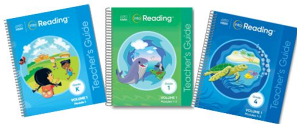
K5–5th grade Houghton Mifflin Harcourt Into Reading 2022