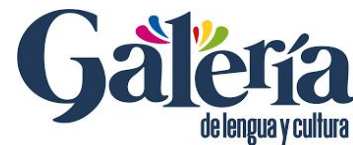
7th and 8th bilingual