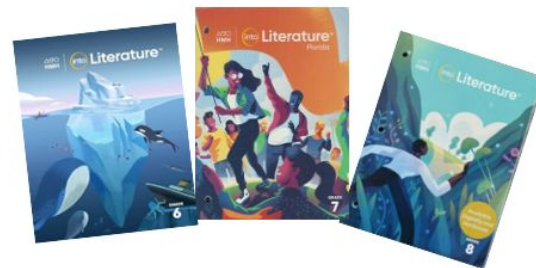
6th–8th Houghton Mifflin Harcourt Into Literature 2022