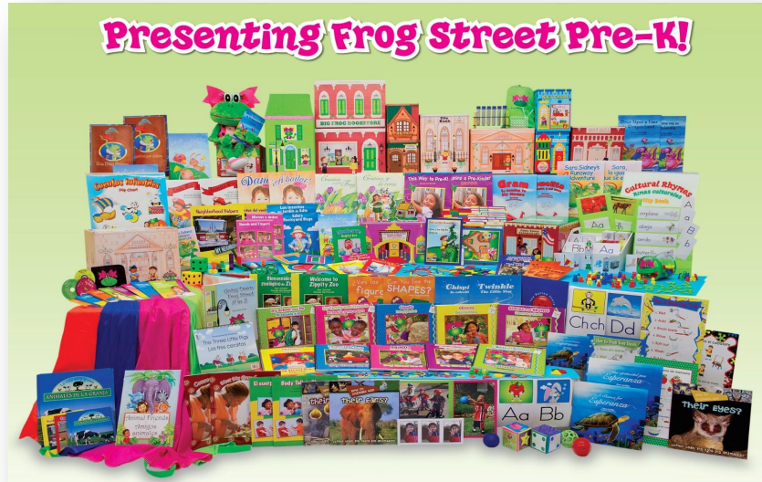
Comprehensive Pre-Kindergarten Curriculum