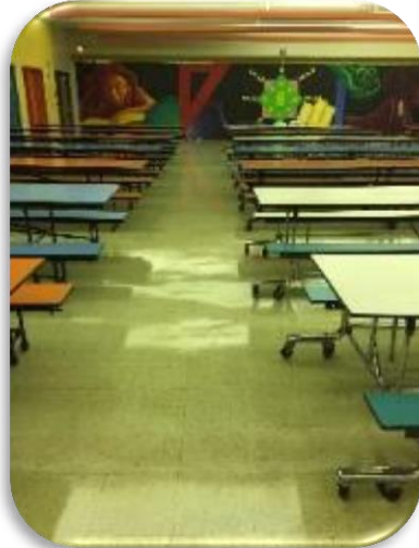
Gwen T. Jackson Cafeteria