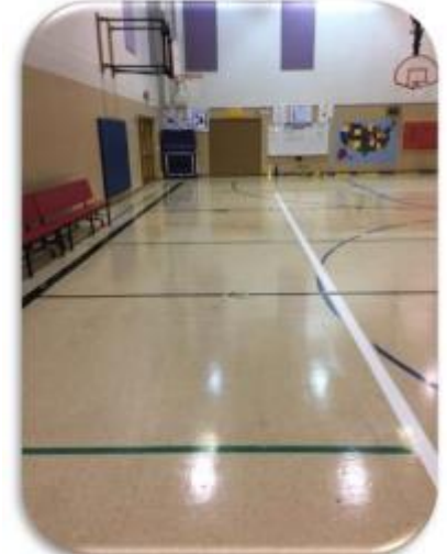
Clarke Street School Gym