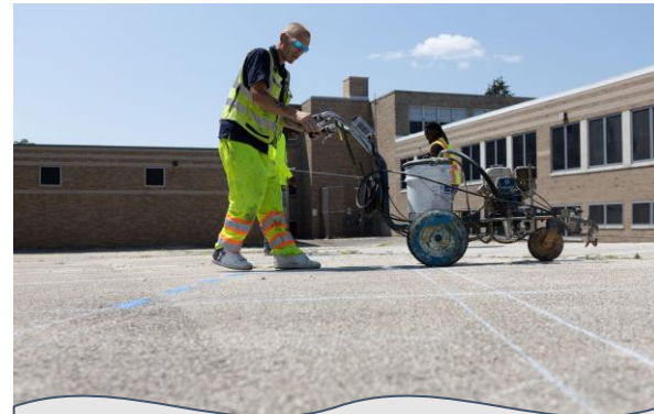
Playground Improvements & Fitness Rooms