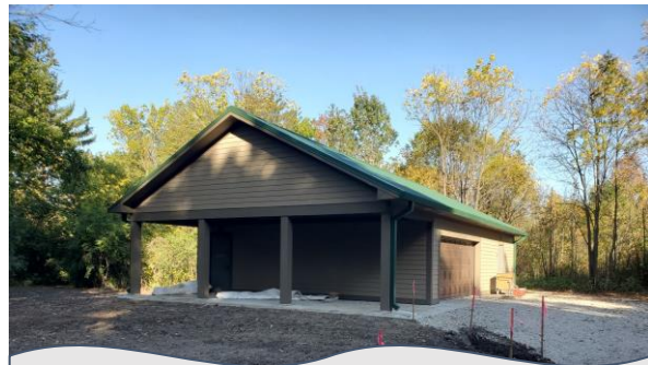
New Ropes Course Building & Elements at Potter's Forest