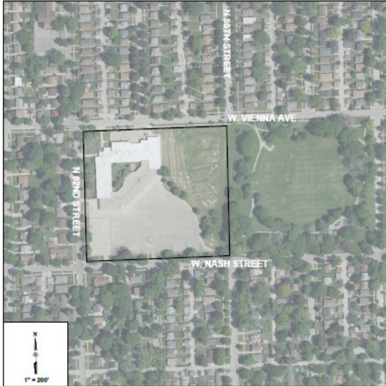
EXHIBIT B LOCATION OF PROPERTY