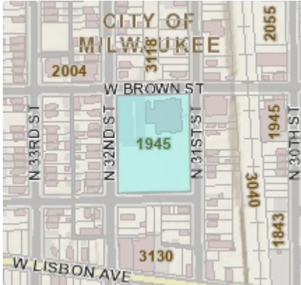
Parcel location within Milwaukee County