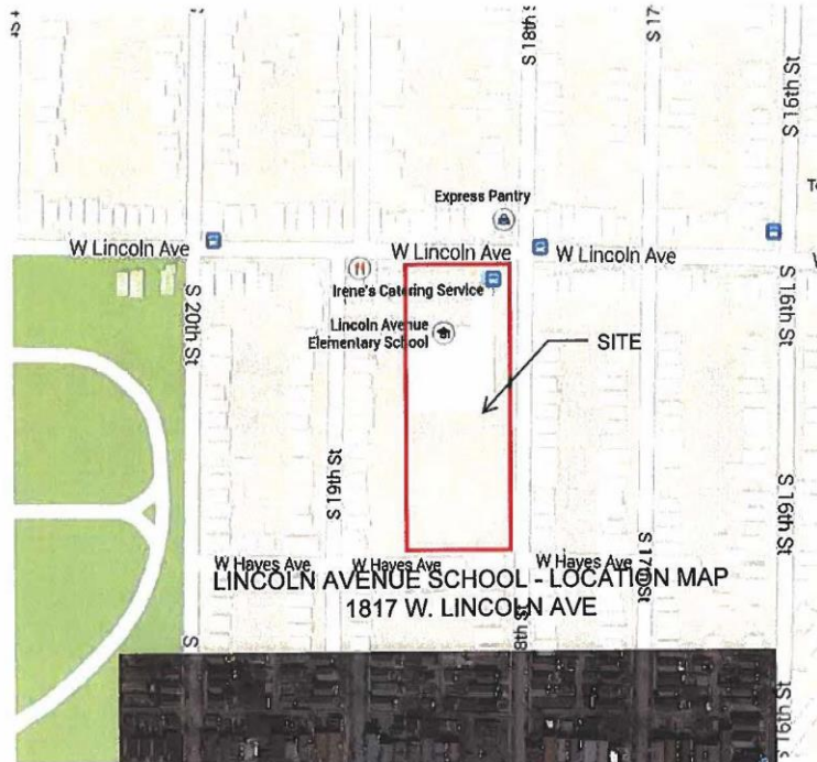
LINCOLN AVENUE SCHOOL - LOCATION MAP 1817 W. LINCOLN AVE