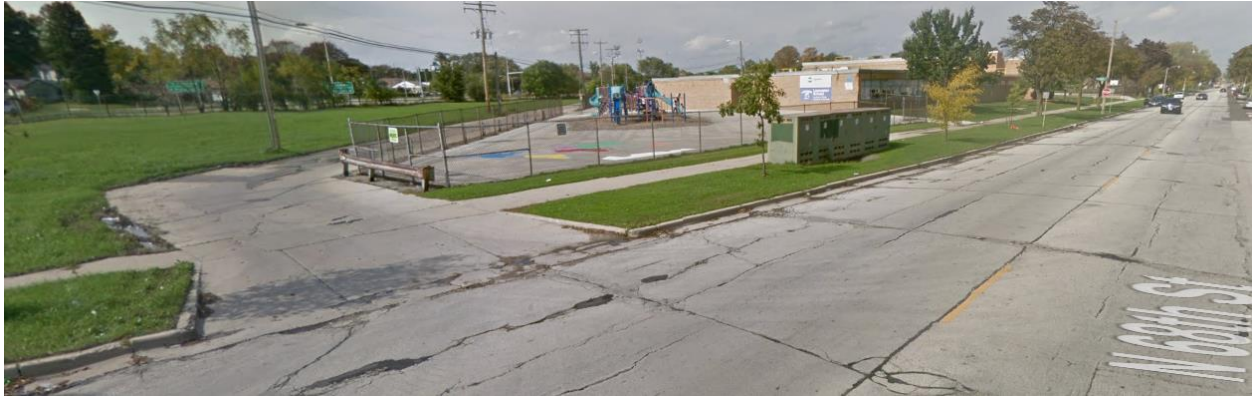
View of N. 68th Street Entrance