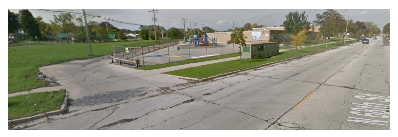
View of N. 68th Street Entrance