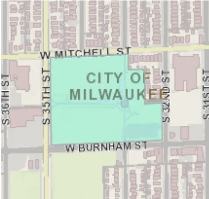
Parcel location within Milwaukee County