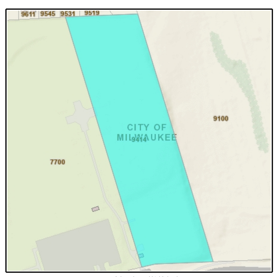
Selected parcel highlighted

Address:9414 W CALUMET RDAssessed Value:$0Municipality:MilwaukeeLand Value:$0