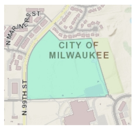
Parcel location within Milwaukee County