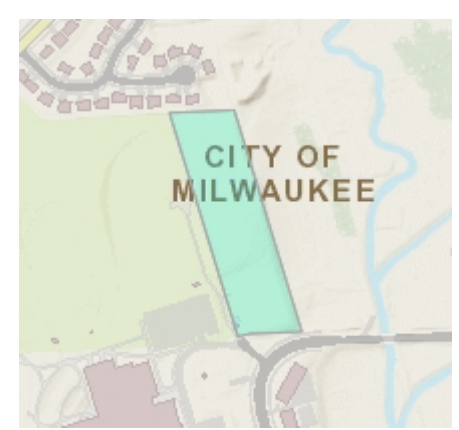
Parcel location within Milwaukee County