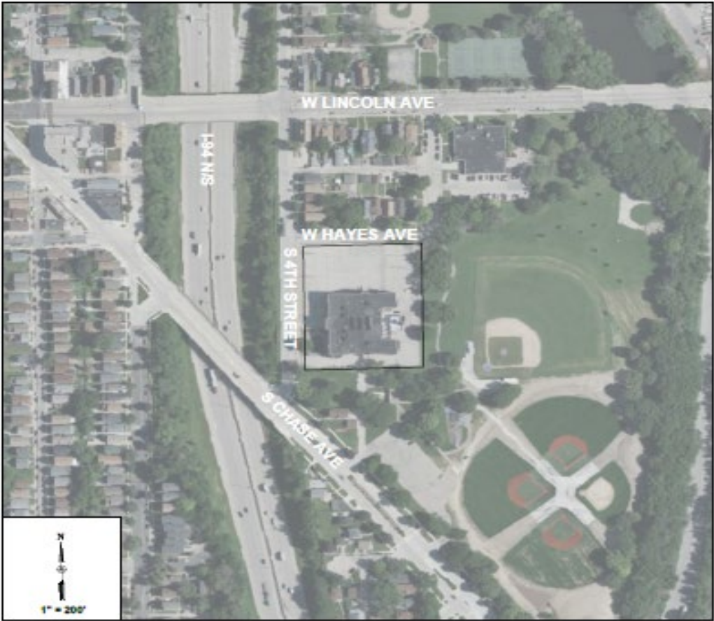
EXHIBIT B LOCATION OF PROPERTY