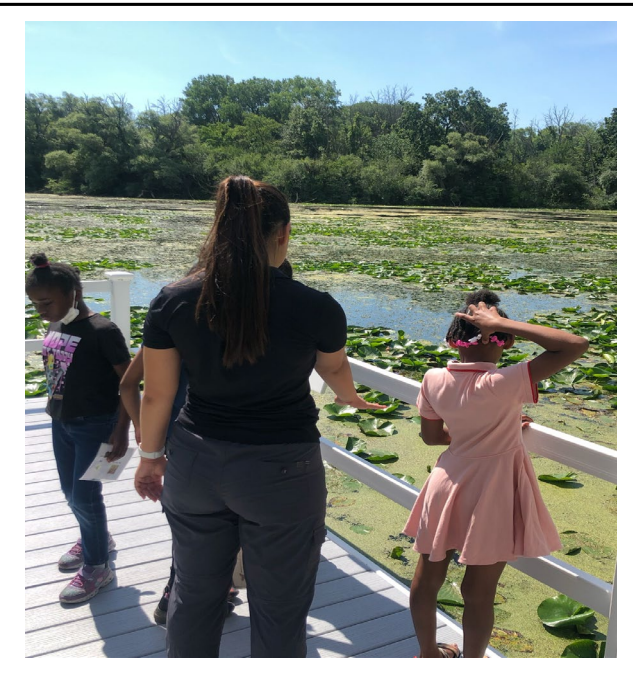
Wehr Nature Center Adventure