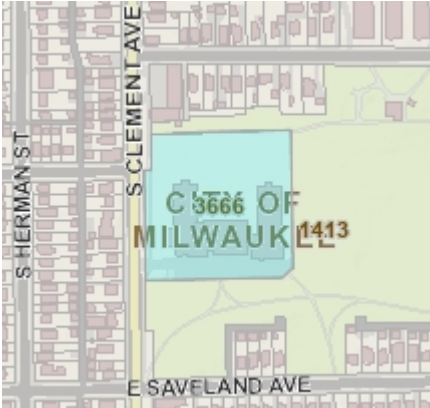
Parcel location within Milwaukee County