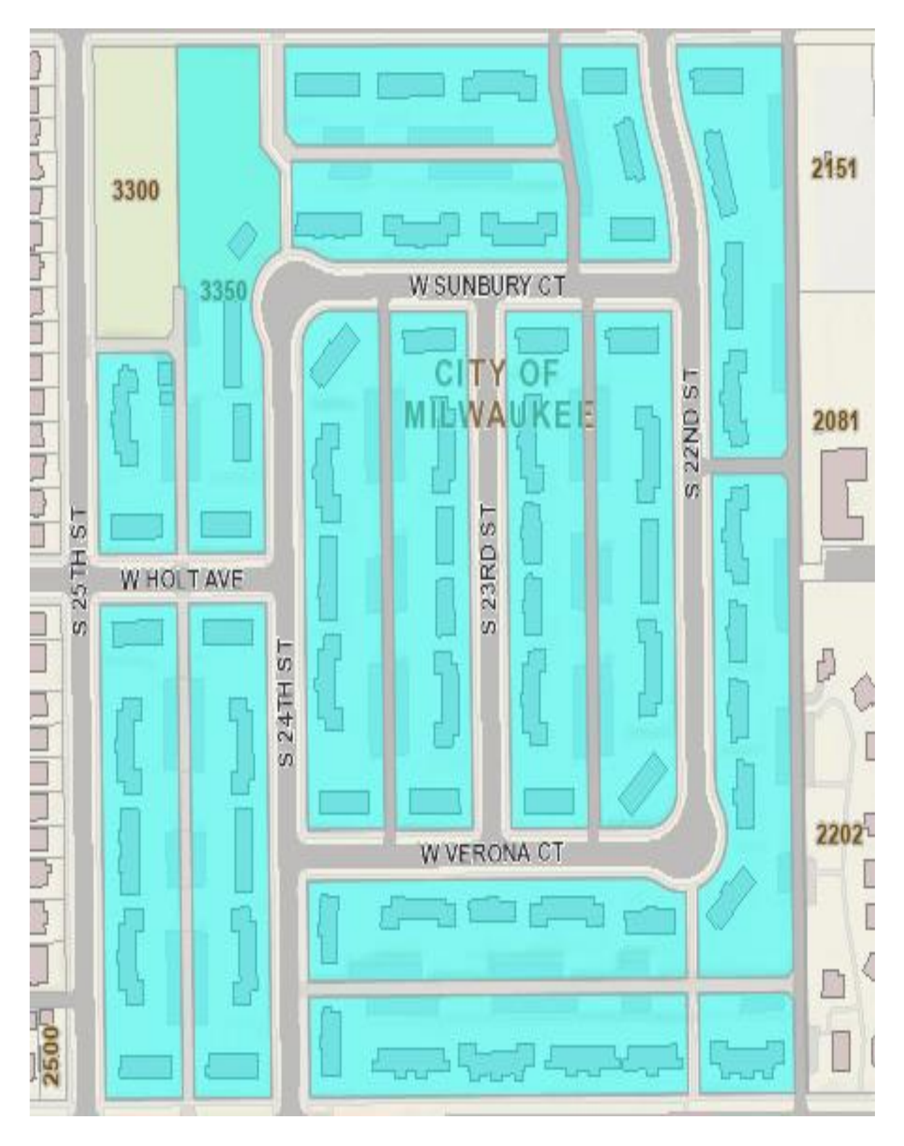
EXHIBIT B MAP SHOWING THE LOCATION OF THE PROPERTY