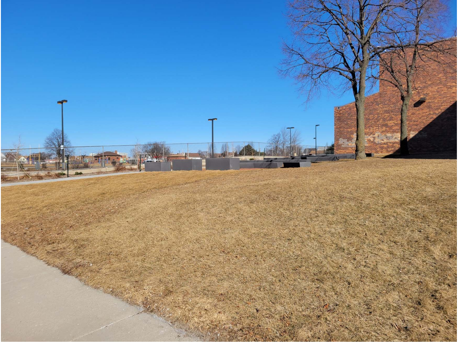
Approximate proposed location of the St. Boniface Catholic Church Wisconsin State Historical Marker