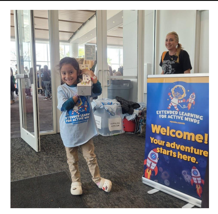
Discovery World Family Engagement Day