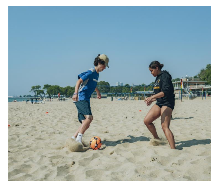
UWM Beach Soccer