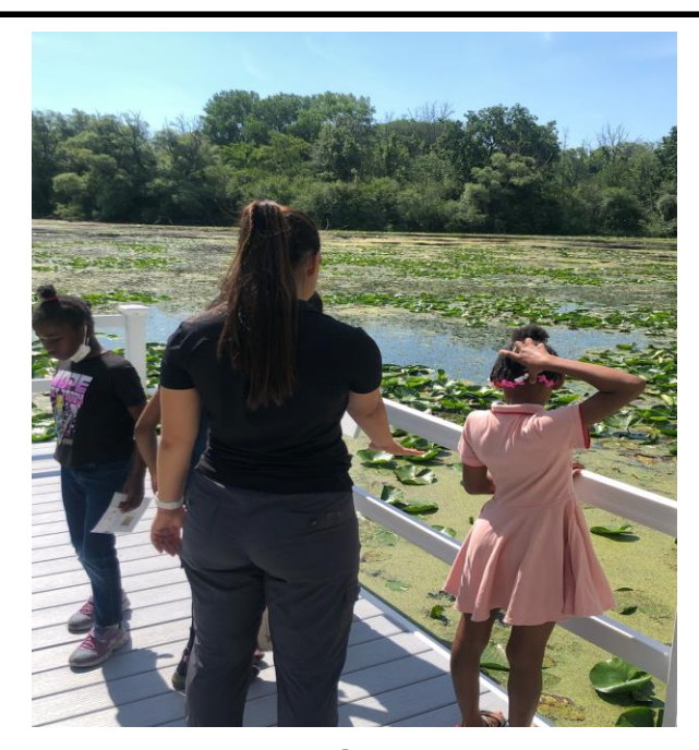
Wehr Nature Center Adventure