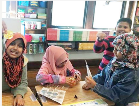
Using Science to Teach English