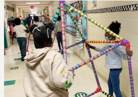
Integrating Art in Math