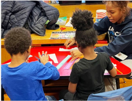
Learning to Teach in Early Childhood