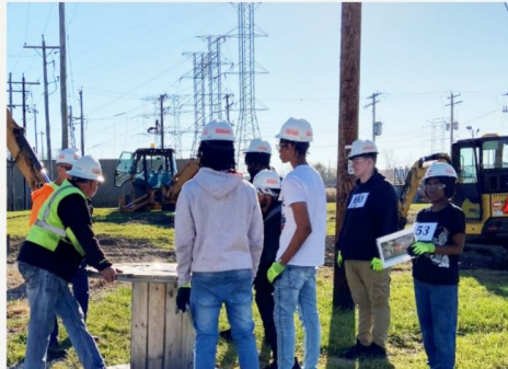
Working alongside WE Energies