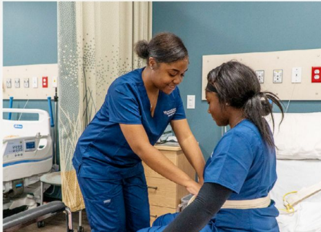
Learning to be a Nurse